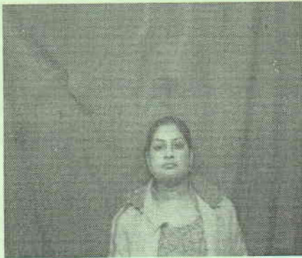
Ist Party न्यासकर्ता

Reg. No. 3554 Reg. Year 2011-2012 Book No. 4